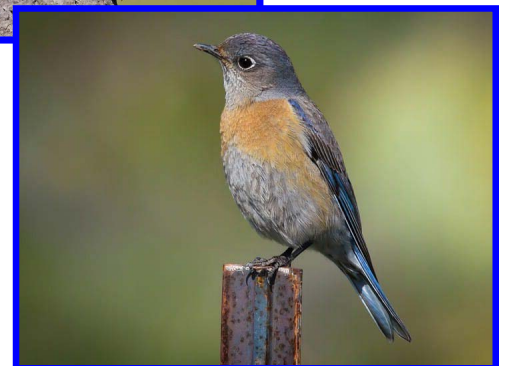
Western Blue birds, Male and Female